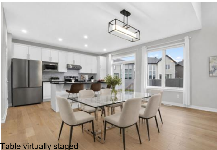
Table virtually staged